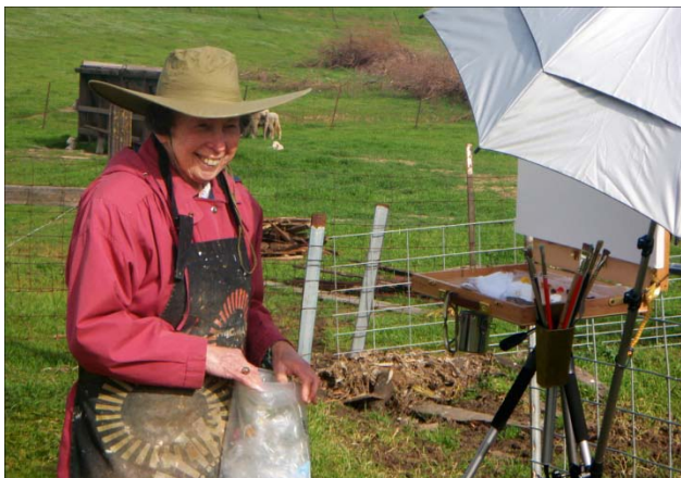
Artist at Slaven Ranch

YoloArts is in good company with two dozen communities across the nation having been recognized as a leader in weaving the arts into economic development. This recognition comes in the form of a grant from ArtPlace , a new and innovative public-private collaboration formed to accelerate creative placemaking across the United States, an emerging approach to economic development as a promising way to increase the vitality of communities and help them grow.