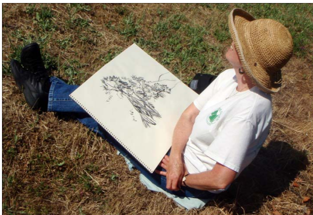
Artist working on her inspiration at Rominger Vineyards

the Arts and seven federal agencies. Its aim is to drive revitalization across the country by putting the arts at the center of economic development. ArtPlace announced its first round of grants on September 15, 2011, investing $11.5 million in 34 locally initiated projects in cities from Honolulu to Miami. Each project supported by ArtPlace was selected for developing a new model of helping communities thrive by strategically integrating artists and arts organizations into key local efforts in transportation, housing, community development, job creation and more. As a small county arts council, YoloArts successfully competed for national recognition of its vital, exciting program rooted in art and agriculture.